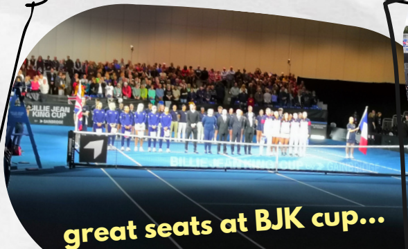
great seats at BJK cup...