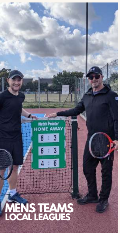
MENS TEAMS LOCAL LEAGUES