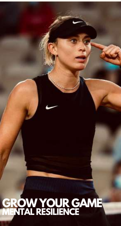
GROW YOUR GAME MENTAL RESILIENCE