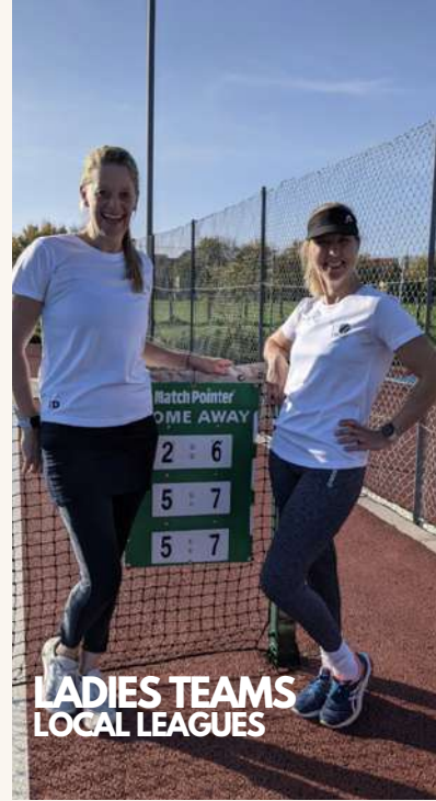
LADIES TEAMS LOCAL LEAGUES