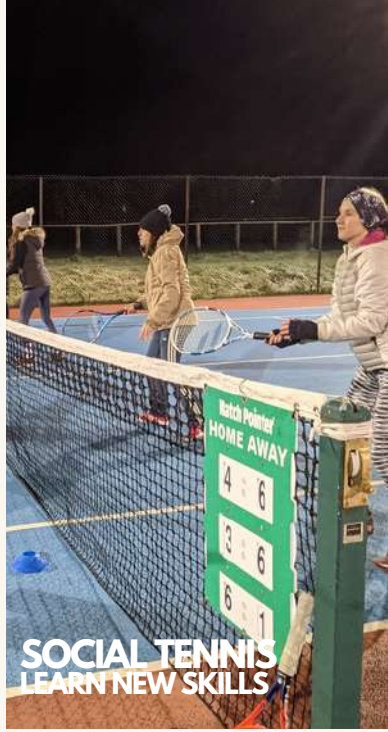
SOCIAL TENNIS LEARN NEW SKILLS