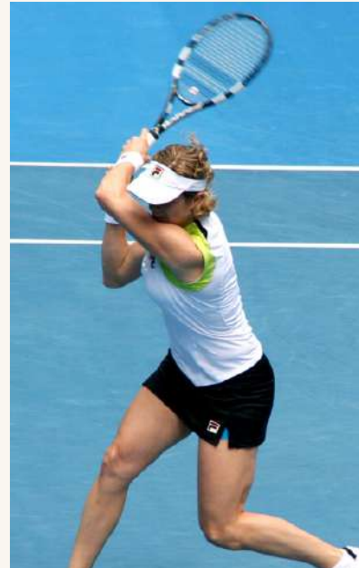
SELF IMPROVEMENT & COACHING