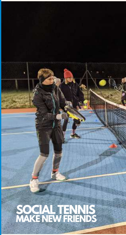
SOCIAL TENNIS MAKE NEW FRIENDS