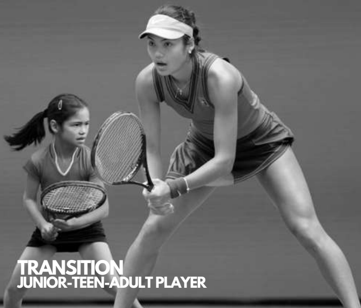
TRANSITION JUNIOR-TEEN-ADULT PLAYER