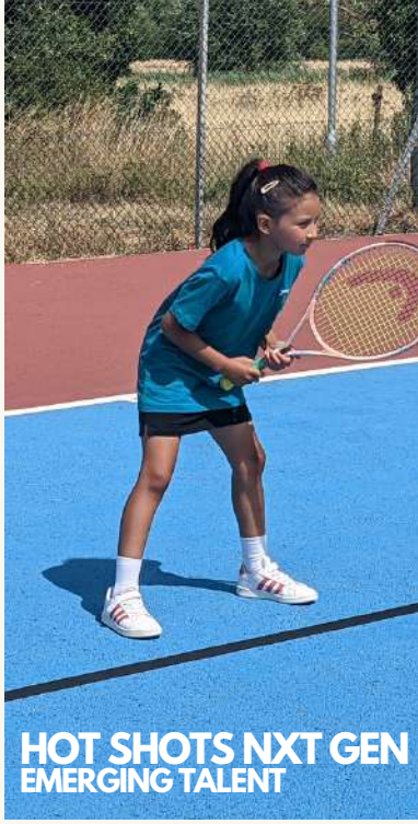
HOT SHOTS NXT GEN EMERGING TALENT