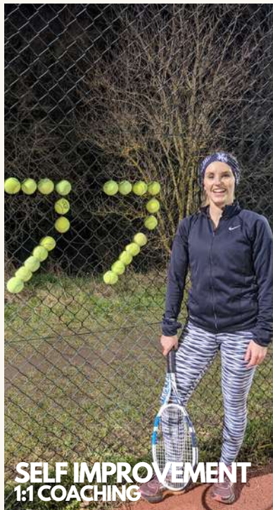
SELF IMPROVEMENT 1:1 COACHING