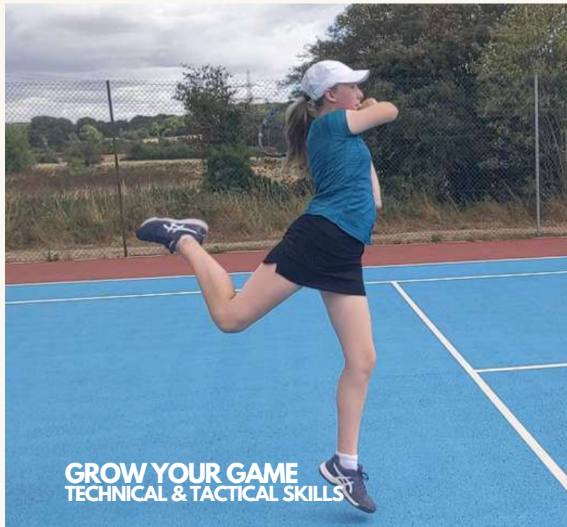
GROW YOUR GAME TECHNICAL & TACTICAL SKILLS