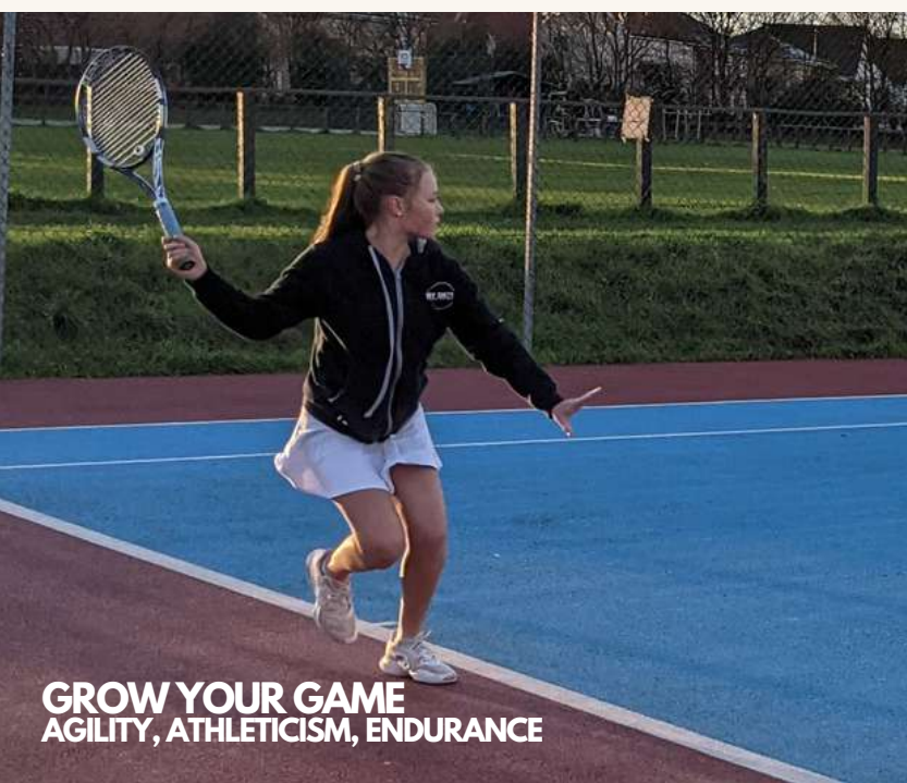
GROW YOUR GAME AGILITY, ATHLETICISM, ENDURANCE