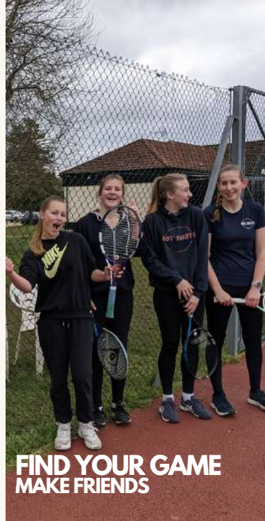
FIND YOUR GAME MAKE FRIENDS