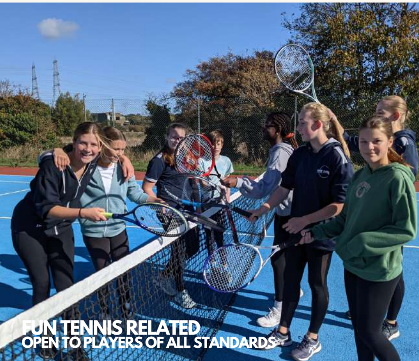
FUN TENNIS RELATED OPEN TO PLAYERS OF ALL STANDARDS