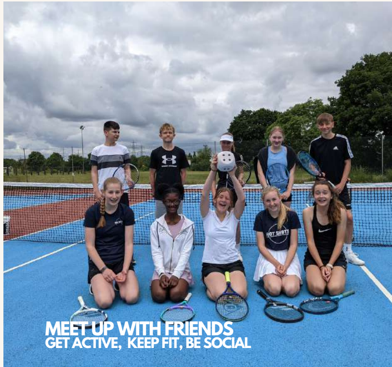
MEET UP WITH FRIENDS GET ACTIVE, KEEP FIT, BE SOCIAL