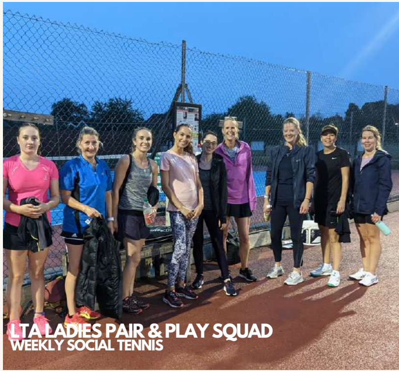
LTA LADIES PAIR & PLAY SQUAD WEEKLY SOCIAL TENNIS