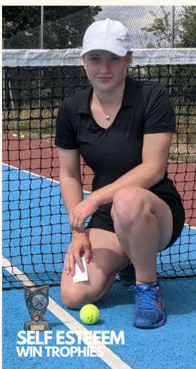
SELF ESTEEM WIN TROPHIES