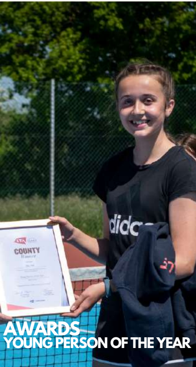
AWARDS YOUNG PERSON OF THE YEAR