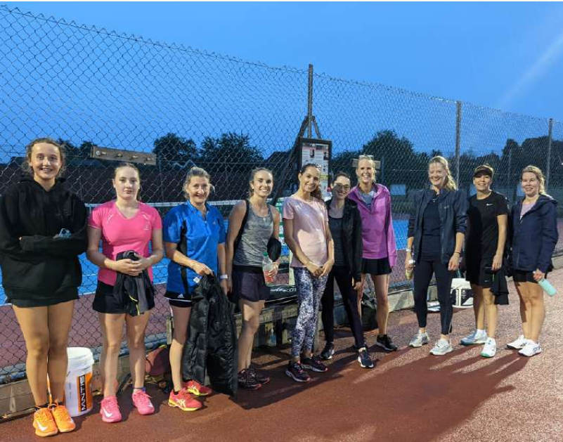
LADIES TEAM PLAYERS INSPIRING FUTURE GENERATIONS