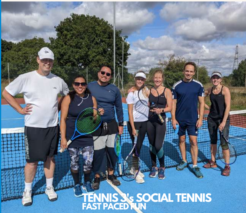
TENNIS 3's SOCIAL TENNIS FAST PACED FUN