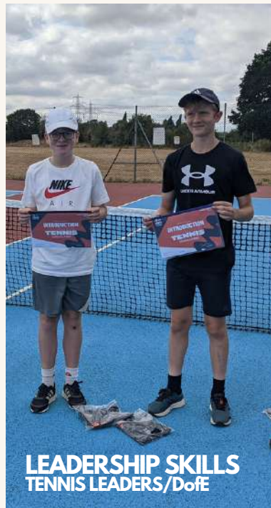
LEADERSHIP SKILLS TENNIS LEADERS/DoFe