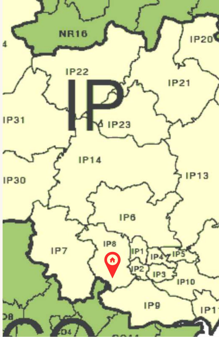
Bramford Tennis Club - IP8 4HU members + casual users - 12 mile radius

Bramford is adjacent to some of the most deprived areas of Ipswich (IP1 & IP2) which both have an IMD rating of \leq 3 . Our inexpensive membership rates, casual pay & play and non-member coaching options however still help to attract players from these areas and the floodlight project will allow us to extend additional court time with priority access to those from disadvantaged communities through our planned weekly “Tennis for Free” initiative session (note 1)