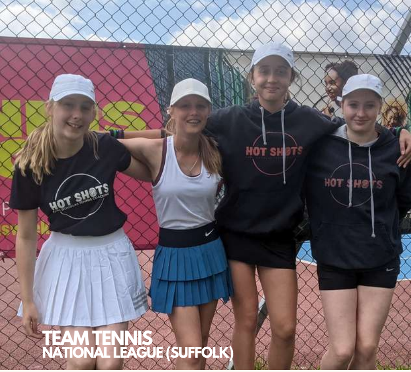
TEAM TENNIS NATIONAL LEAGUE (SUFFOLK)