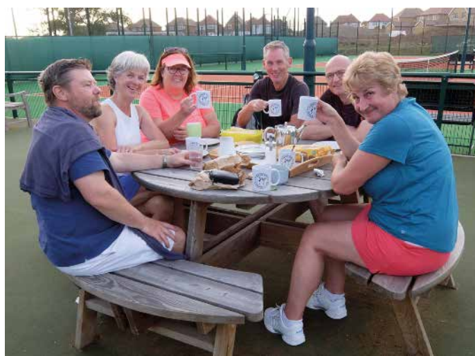
View more photos on our Facebook page.