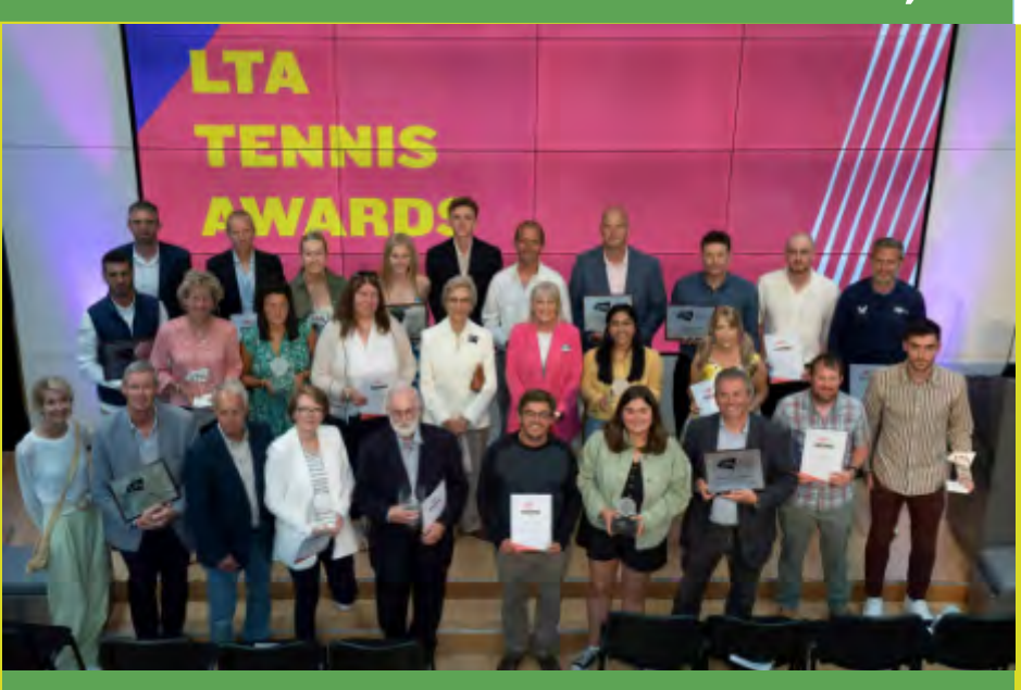
Nominations are open for 2024 and close on 30th November 2023. Details can be found online at: www.lta.org.uk/about-us/what-we-do/lta-tennis-awards/

Yorkshire has amassed several national and regional awards in the last five years so it really is worth putting in a nomination. The 2024 national winners will be announced at the National Awards presentation at Wimbledon in July 2024.