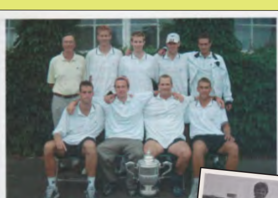
Yorkshire Men at Eastbourne, Gr