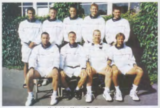
Yorkshire Men at Eastbourne