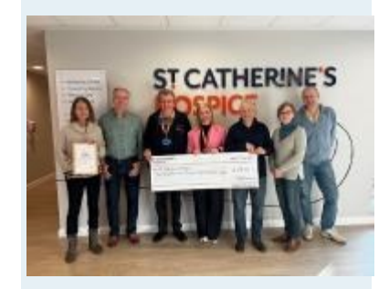
Cheque presentation to St Catherine's Hospice

During the evening there were several raffle prizes to be won. And our nominated charity of the night St Catherine's Hospice received a £238 donation.