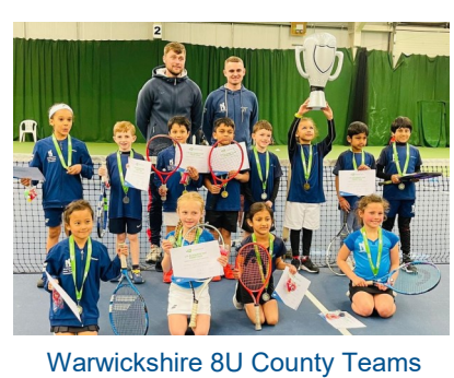
entered two boys teams and one girls team. Boys Team A—1st Place, Boys Team B-2nd Place and Girls Team A—1st Place