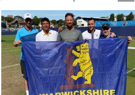
Mens 035s team gain promotion