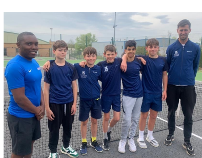
14U Boys finished 2nd in their group