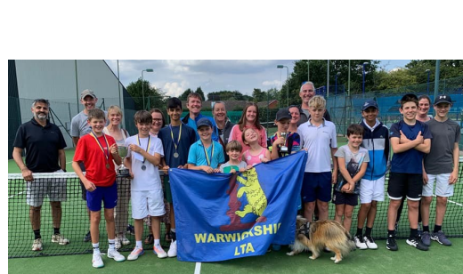
Warwickshire County Championships took place at Sutton Coldfield Tennis Club. For full results please click here