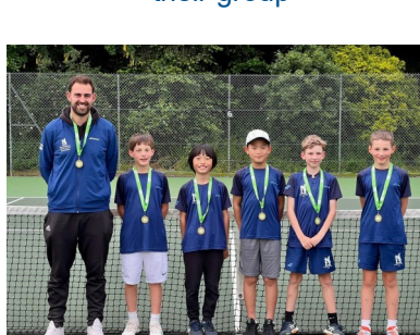
10U Boys finished 1st in qualifying for Nationals. They finished 7th at Nationals