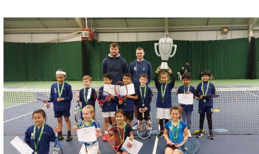
We had three teams compete in a trial 8U County Cup event at Kings Park TC. We finished 1st and 2nd in the Boys event and 1st in the girls event.