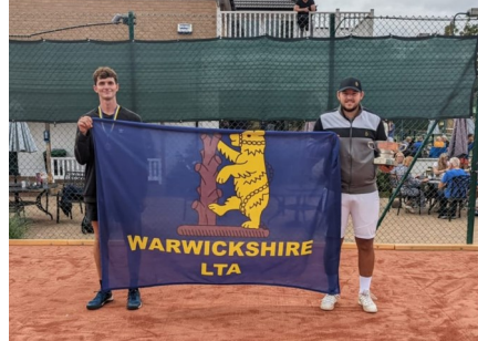
Warwickshire County Championships (open) took place at Leamington. Click here for full results.