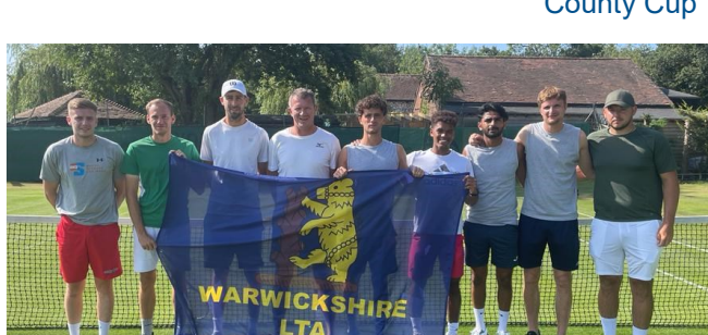
Men gain promotion at County Week to group 3