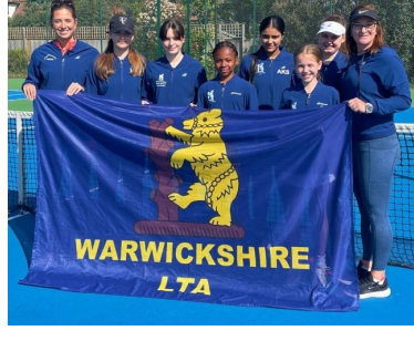
14U Girls finished 3rd in their group