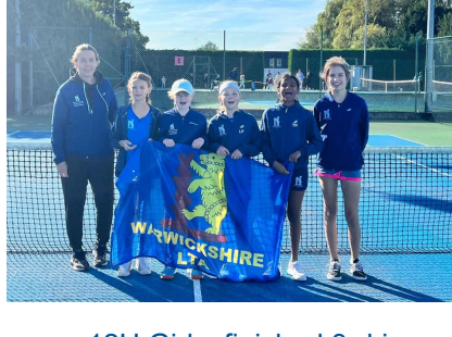
12U Girls finished 3rd in their group

Full County Captains reports are posted on warwickshiretennis.net , including team details and match results.