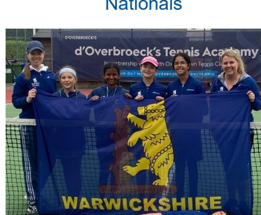
11U Girls finished 1st in qualifying for Nationals.