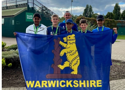
12U Boys finished 1st in qualifying for Nationals. They finished 5th at Nationals