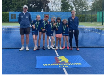
10U Girls finished 1st in qualifying for Nationals. They finished 4th at Nationals