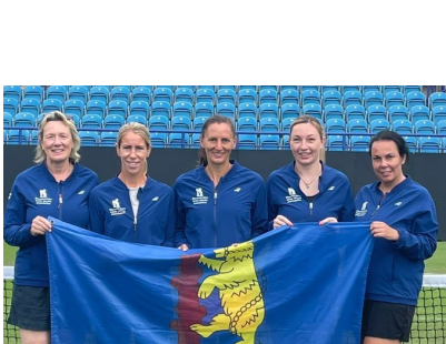
Ladies 035s team competes at Eastbourne