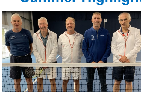
Warwickshire 065s win division 2 and gain promotion