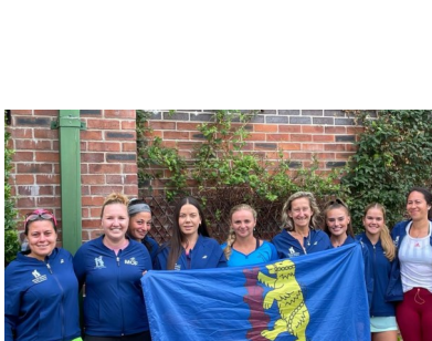
Ladies competed in Summer County Cup