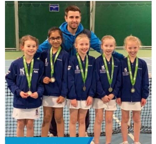
Warwickshire 9U Girls County Cup Team Group Winners