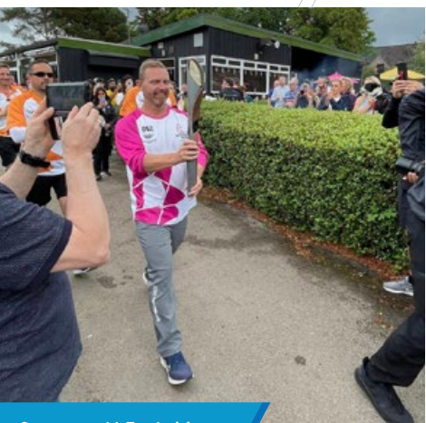
Commonwealth Torch visits Hampton-in-Arden Tennis Club