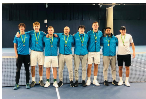
Herts Men's Winter County Cup team promoted to group 1