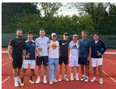
The Men's finalists (Rickmansworth on the left)