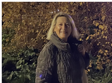
All I want for Christmas is you