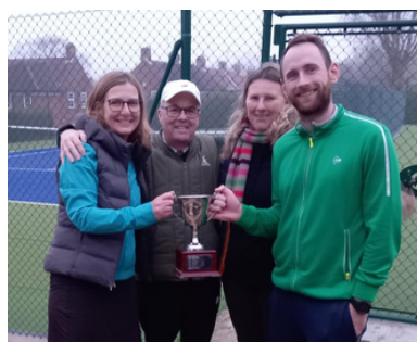
The Stuart West Trophy winning team