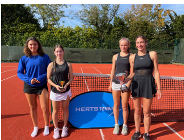
The triumphant Townsend Ladies team

Huge thanks to all four teams for treating the lucky spectators to some superb tennis and to Townsend and its members for being such welcoming hosts.