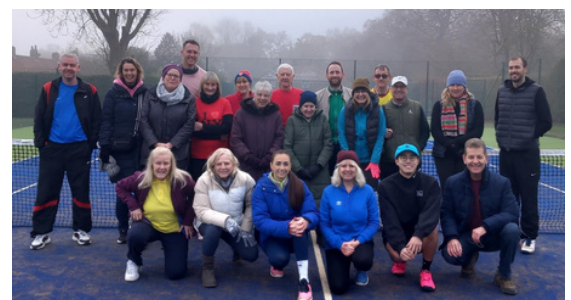
The players take to the court for a pre-tournament photo