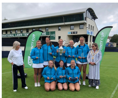
Herts Ladies - Summer County Cup national champions