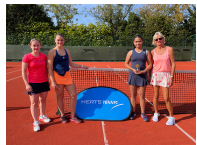
The Ladies Runners-Up, St Albans