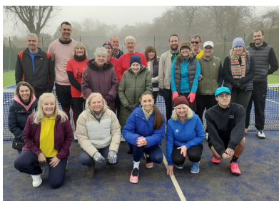
Baby, it's cold outside