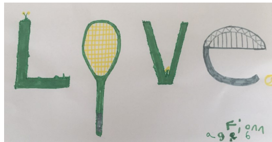
Young junior winner - Fionn (aged 6)